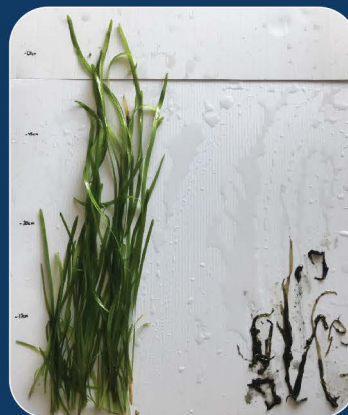
Vallisneria Pre-Treatment & 4 Weeks Post-Treatment