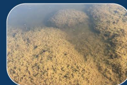
Chara 3 Days Post-Treatment