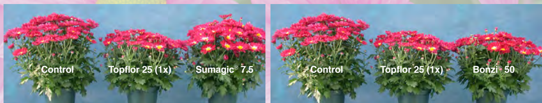
Applied 2 weeks after pinch. 25 ppm Topflor spray performed similar to 7.5 and 50 ppm of Sumagic and Bonzi, respectively.