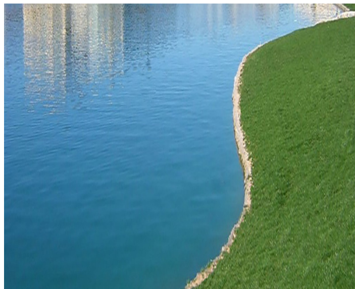
Figure 1. for use in lakes, ponds, and decorative water features with little or no overflow.